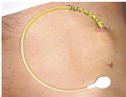
Figure 2. Long-term abdominal drain in situ

The two currently available LTADs in the UK, manufactured by either Rocket Medical or Becton, Dickinson and company (BD) will be used for this study (see Figure 2 Long-term abdominal drain in situ). This will depend on stock availability and site preference. Participants attending for LTAD placement will have their travel costs reimbursed.