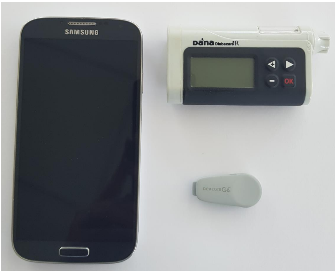
Figure 1A CamAPS FX comprises Samsung Galaxy phone (or similar) running Cambridge control algorithm, Dana insulin pump (Sooil), G6 real-time CGM sensor (Dexcom).

An overview of this proposed automated closed loop platform is given in Figure 1A.