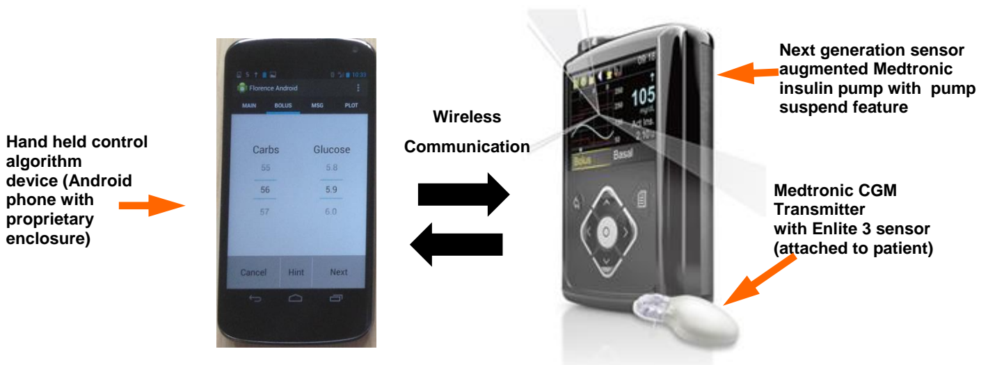
Figure 1: Representative design of the proposed FlorenceM automated closed loop system

An overview of this proposed automated closed loop system is given in Figure 1.